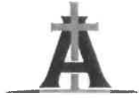
Main school logo 2